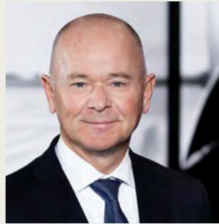
Micael Johansson President and Chief Executive Officer (CEO)

Born 1960 B.Sc. in Mathematics and Computer Science studies Employed 1985 Shares in Saab: 49,306