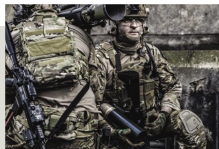
Man-portable and mission-ready

Replacing the mechanical fuze with a small electro-mechanical one not only helps reduce weight so that the round leaves the barrel with higher muzzle velocity, but it also increases accuracy, engagement time and range. The fire team are able to select either impact mode, where the round detonates on contact with the target, or air-burst mode, where the round detonates above the target.