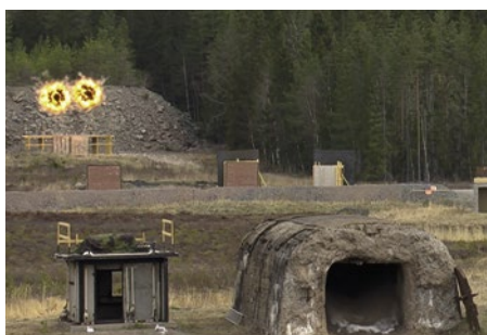
Effective in any environment