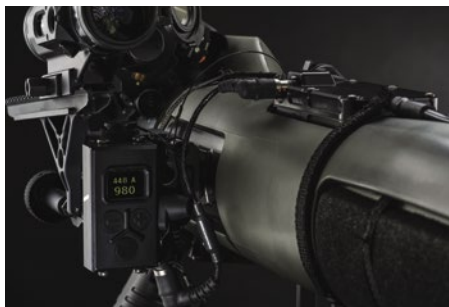
The FCD provides superior accuracy