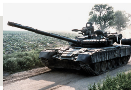
HEAT 751 can defeat any modern MBT

HEAT 751 provides dismounted soldiers with the capability to defeat even the modern MBT on the battlefield, a capability that increases the confidence and survivability of your soldiers, capable of penetrating a NATO triple heavy target equipped with ERA.