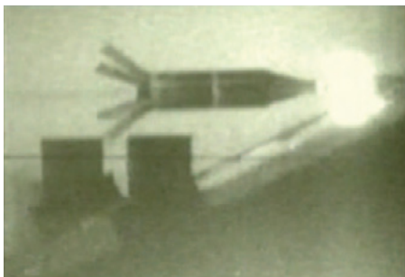
Initiation of the first charge