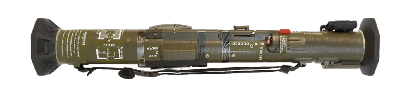
— AT4CS AST -