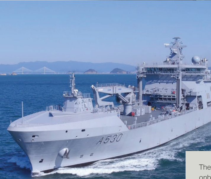
The Norwegian Navy's support ship KNM Maud is fitted with an onboard hospital which is both designed and partly equipped by Saab..

Saab Naval Hospitals can be tailored to a wide range of combat and support vessels, including, patrol vessels, frigates, destroyers, submarines, support and amphibious ships.