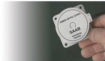
Fiber Optic Gyro (FOG).

A Fiber Optic Gyro is based on the Sagnac effect. The time for light to travel in a coil is dependent of the rotation of the coil. In a ring fiber optic gyro light is divided into two beams entering a fiber coil in opposite directions. After exiting the coil the two beams are combined in a coupler and a phase difference proportional to the rate of rotation is measured