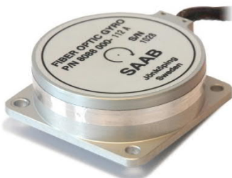
Fiber Optic Gyro (FOG).

This family of new generation Gyro Units is specifically designed for stabilization applications where there is a need for rate sensing. They offer a very attractive solution based on fiber optic gyro technology that gives a number of benefits. The units are equipped with Saab manufactured single axis Fiber Optic Gyros with built-in temperature sensor. They also include DC/DC converters, analog compensation electronics and filters to comply with international standards of EMI requirements. These units are available in single-axis, dual-axis and three-axis configuration.