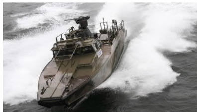
Stabilization of Remote Weapon Station with Saab FOG-Unit.