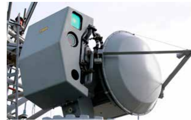
CEROS 200 CWI version.

The versatile CEROS 200 tracks supersonic missiles and surface targets extremely well, even close to the ship. This gives the advantage of full performance against any threat, including asymmetric threats in littoral environments.