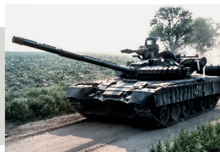
HEAT 751 can defeat any modern MBT

HEAT 751 provides dismounted soldiers with the capability to defeat even the modern MBT on the battlefield, a capability that increases the confidence and survivability of your soldiers, capable of penetrating a NATO triple heavy target equipped with ERA.