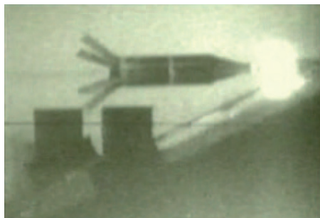
Initiation of the first charge