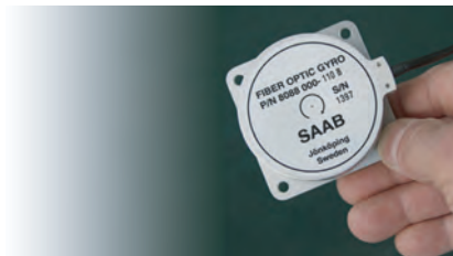
Fiber Optic Gyro (FOG).

The digital output alternative. Based on our Fiber Optic technology backed up by over 40-years experience in inertial sensors.